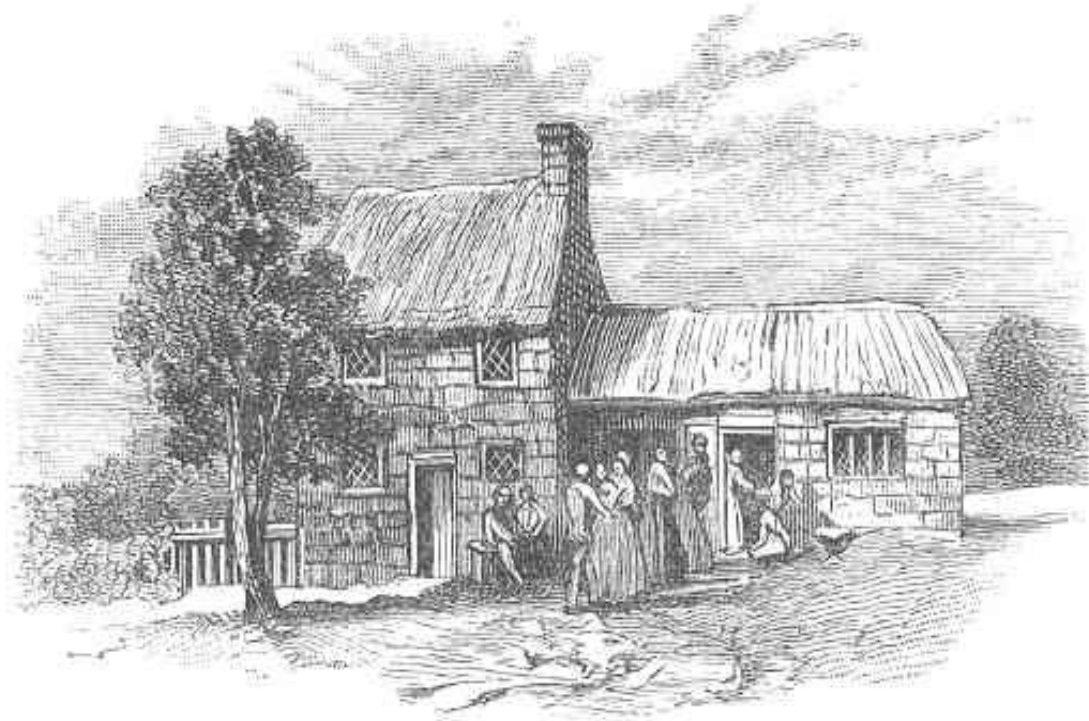
WILLIAM CAREY'S BIRTHPLACE.